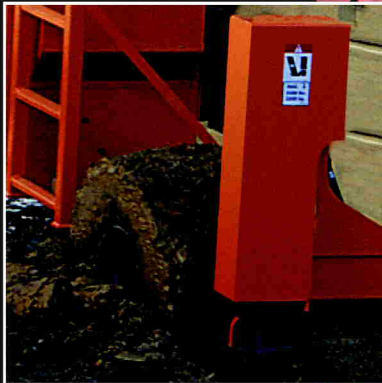
Unmatched Rough Terrain Performance