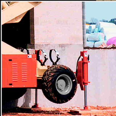
Independently Controlled Leveling Jacks for Enhanced Performance